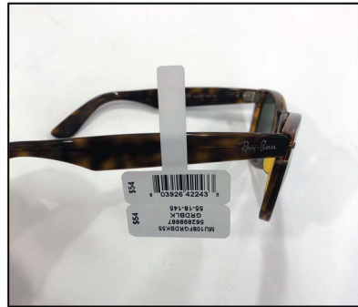
#2 Center tag between endpiece and temple tip of right temple