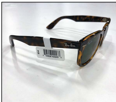
#5 Finished Look