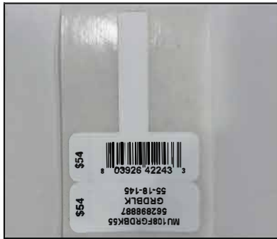
#1 UPC Information Tag