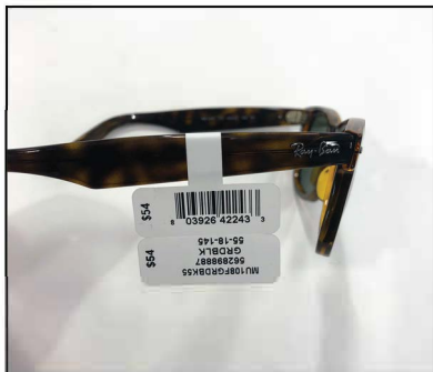
#3 Fold over middle of right temple (adjust fold to temple dimension)