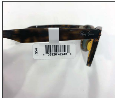
#4 Fold up lower portion of tag – UPC faces outside of frame, model information inside